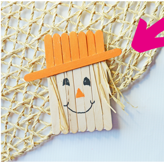
POPSICLE STICK SCARECROW