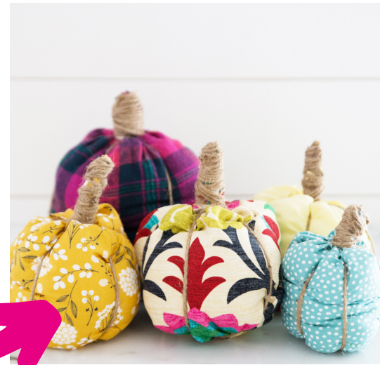
DIY NO SEW PUMPKINS