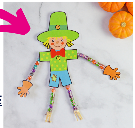
DIY SNACK CAKE SCARECROW